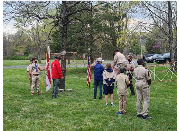
Troop 40 at the Pack 120 Crossover

As a District, we also had our first in-person Roundtable at Massanutten Presbyterian Church. We discussed Membership and how to recruit youth in the summer. One takeaway from Roundtable would be to make sure your unit's BeAScout.com pin is up to date, and also make sure that you are looking out for community events for your unit to be at and working on recruiting. The District is working hard to make sure that we are ready for fall recruitment when it is here.