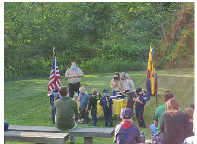
Pack 38 giving out awards and celebrating their crossing over to Scouts, BSA